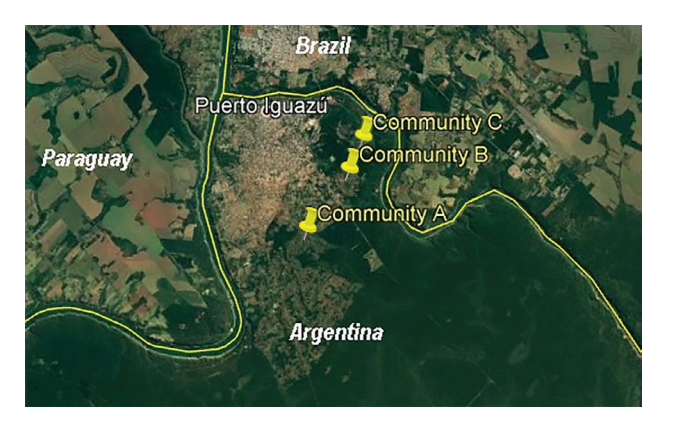
Figure 1 - Geographical location of the Guarani communities in Puerto Iguazu (community A, community B, and community C).

In this country, the total population of Amerindians in 2010 was 955,032 people, spread across 30 different