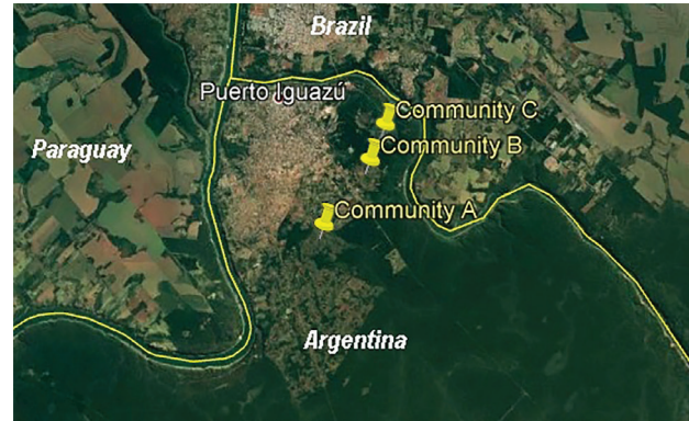
Figure 1 - Geographical location of the Guarani communities in Puerto Iguazu (community A, community B, and community C).

In this country, the total population of Amerindians in 2010 was 955,032 people, spread across 30 different